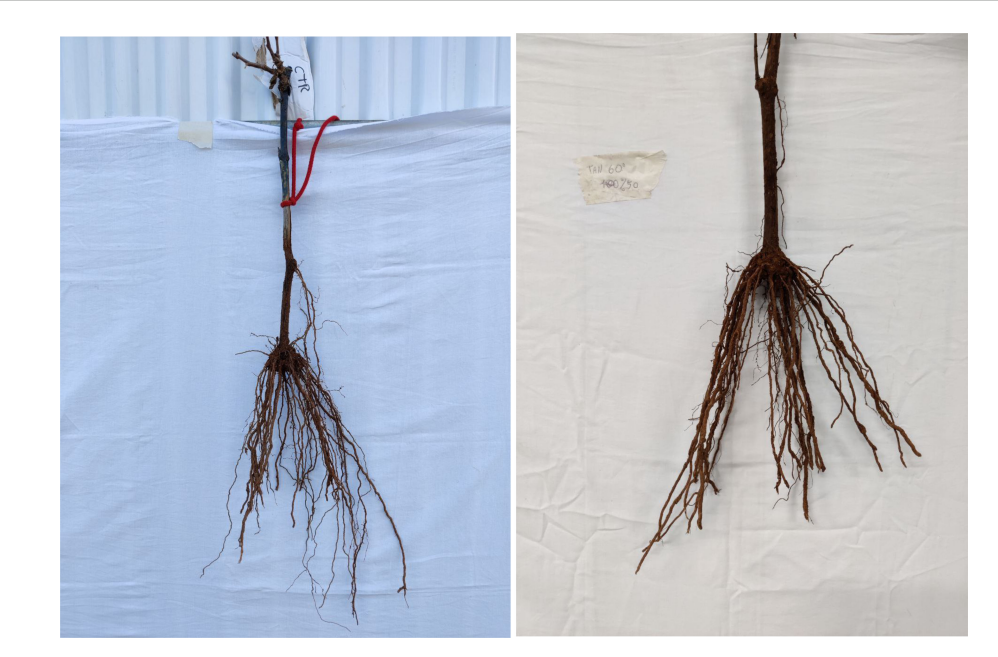
FIGURE 3 Roots of grafted vines, cv. Zibibbo/Paulsen 1103 treated with HyTan extracted at 45°C ( right ) compared to control ( left ). Photographs taken on February 1, 2022.

Using HyTan extracted at 45°C we found the lowest dry weight/ cm values for both fine and thick roots. This can be explained in terms of a greater capacity to accumulate dry matter in the roots subjected to less overall elongation (as in grafted cuttings treated with T60 and T75 HyTan) because, for such reduced growth in length, smaller quantities of assimilates were diverted for this purpose. Indeed, in addition to indicating a greater total accumulation of dry matter generally determined by tannin, data on the distribution of dry matter in Table 7, also show that treatment with HyTan T45 affords a higher S/R ratio, due to higher accumulation of dry matter in shoots and lower in roots. This higher S/R biomass ratio of T45 cuttings can be considered the effect of better growing conditions of the vines, which allows investments in roots to be minimized (Harris, 1992). Woody plants that grow on "good" sites indeed generally tend to allocate a lower proportion of photosynthate to root production than those that grow on "poor" sites (Schenk et al., 2002).